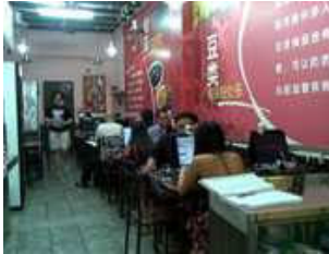
Laptop Internet Cafe